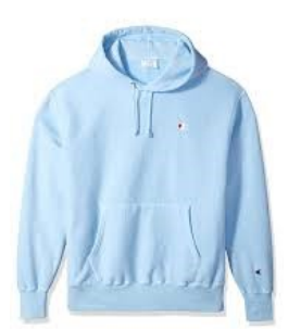
No hoodies please. Students may wear their school uniform sweater.