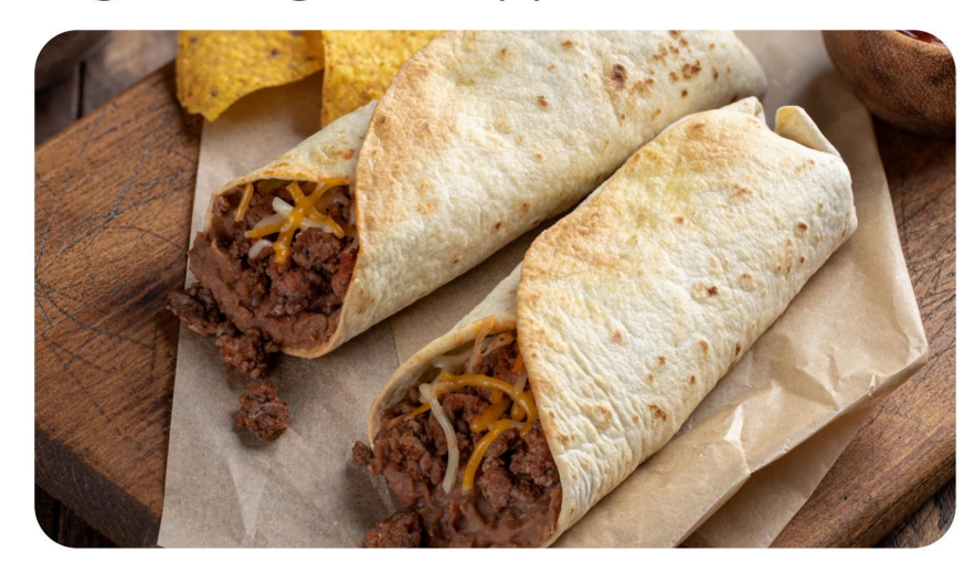
Beef or Bean

Ordering is Easy. Kid Approved. Stress Free.