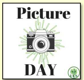
Photo proof packages will be sent out approximately 1 month later. Students who are unable to attend on photo day will have a retake day on Tuesday morning, January 16<sup>th</sup>, 2024.

Afternoon only students are asked to attend school in the morning session so their picture may be included in the class photo and yearbook. All grade 1 students must be in their full school uniform.