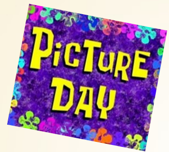
Photo proof packages will be sent out approximately 1 month later. Purchasing a photo package is optional; however, Lifetouch will only be taking Online orders this year. Students who are unable to attend on photo day will have a retake day on Monday morning, January 11 th , 2021.

Part-time and afternoon only students are asked to attend school in the morning session so their picture may be included in the class photo and yearbook. All grade 1 students must be in their full school uniform.